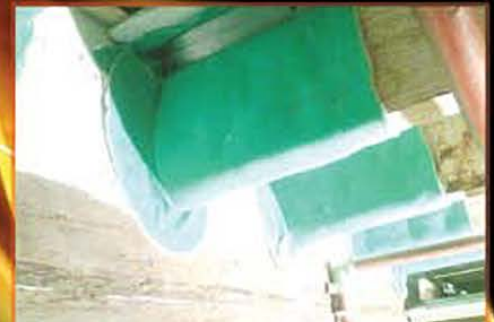
Used For a 3 Sided Application.