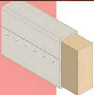
Wrap Plus 60 Around Timber and Secure Using Hammer Tacker and Staples.